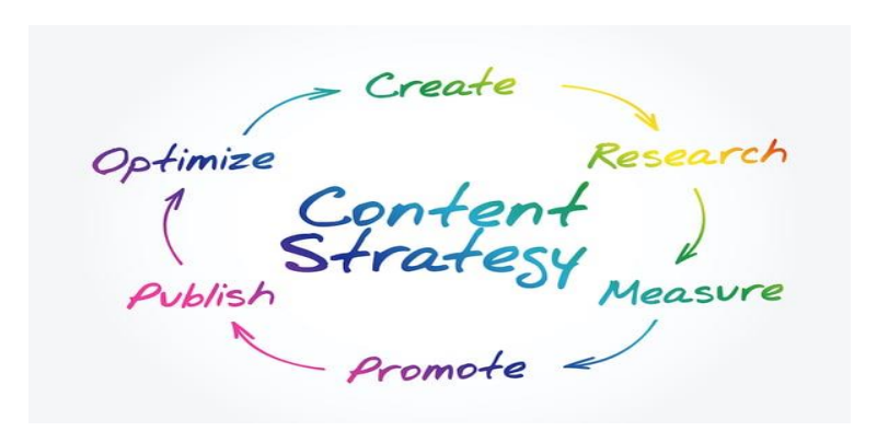
Figure 3. Content strategy<sup>5</sup>