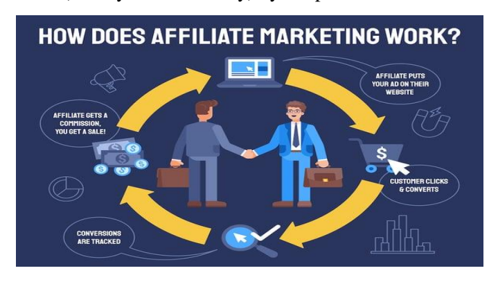
Figure 2. How does affiliate marketing work<sup>4</sup>

• Affiliate marketing is the business promotion within the partner affiliate network. It is applicable when a product is marketed within that network; the products are recommended (or they are sold freely) by the partner sites.