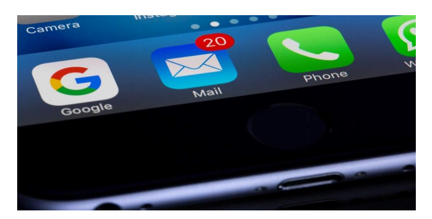
Figure 5.E-mail marketing<sup>7</sup>

It is important that the company reaches customers and create a bidirectional communication pattern, because digital marketing enables customers to provide feedback to the company on a community-based site or directly to the company via email. Companies