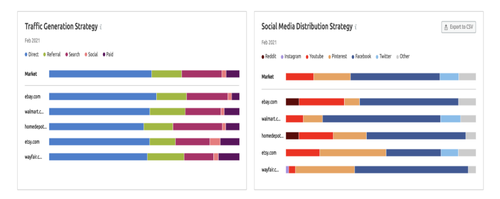
Figure 1. Traffic generation strategy vs social media distribution strategy<sup>3</sup>

fosters continuous improvement of organizations, driving customer engagement and optimizing the return on marketing investment.